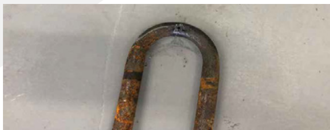
Damaged Bend of U-Tube