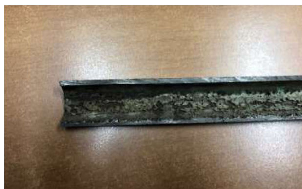
Figure 2: Cut U-tube with wall loss.

After viewing the defect table, the client decided to cut open tube R[4] to verify the wall loss. The wall loss was proven to be at the exact location as indicated in the defect table.